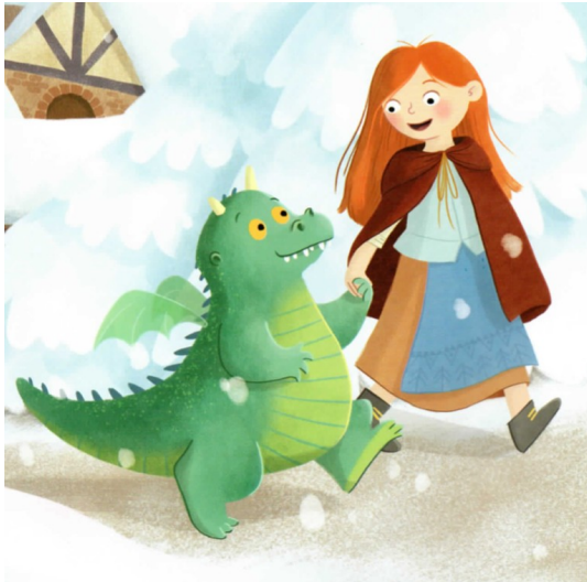
Figure 3 – Edgar from Excitable Edgar