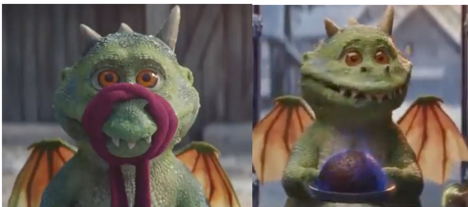
Figure 2a, 2b and 2c – TV Dragon from the 2019 Advert